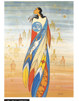
COVER "Not Forgotten"

by Maxine Noel / Ioyan Mani. Something stirred Canada's beloved painter of women to create an image that connects us all to Canada's missing and murdered Indigenous women and girls. See page 16.